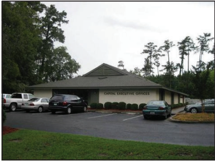
Capital Executive Offices 3236 Landmark Drive, Suite 115 N. Charleston, SC